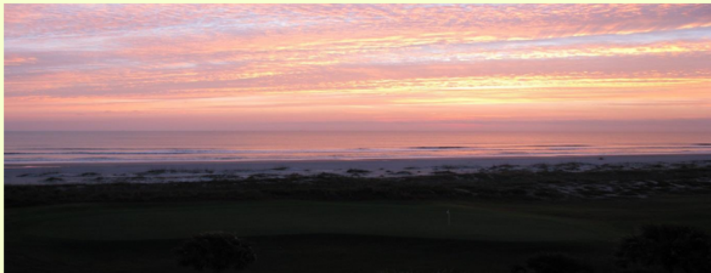
Photo of the sunrise from the hotel room in Amelia Island