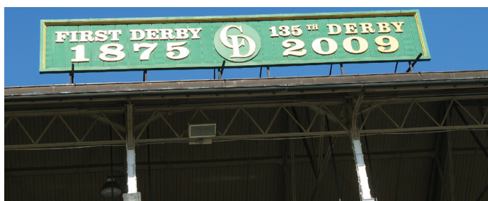
PHOTOS FROM SAS DAY AT THE RACES