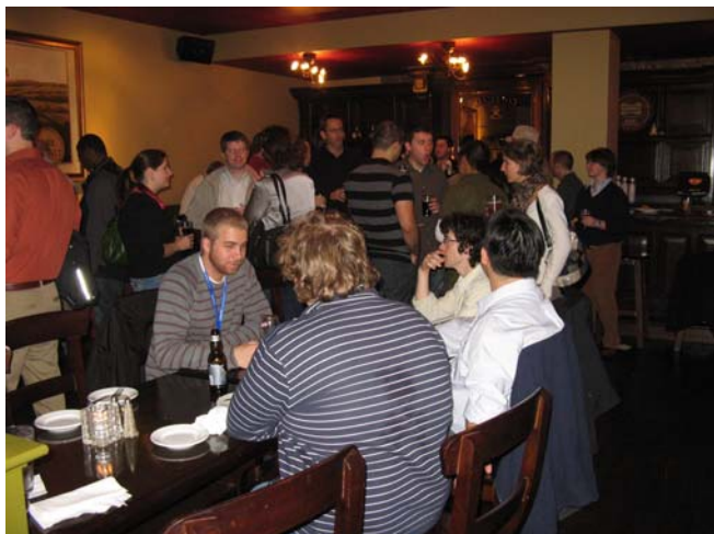
SAS Student Event in Louisville