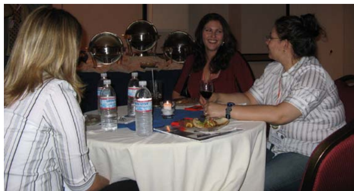
Student event at FACSS in Reno.