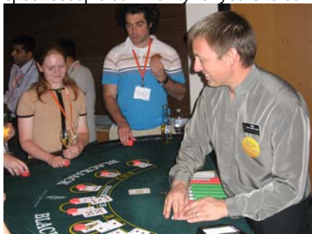
Student event at FACSS in Reno.

Overall, I consider the electronic version of Applied Spectroscopy to be in excellent shape. With two providers of our electronic content, the journal is accessible to a growing number of spectroscopists around the world and should continue to be one of the most valuable services that the society offers to the spectroscopic community for years to come.