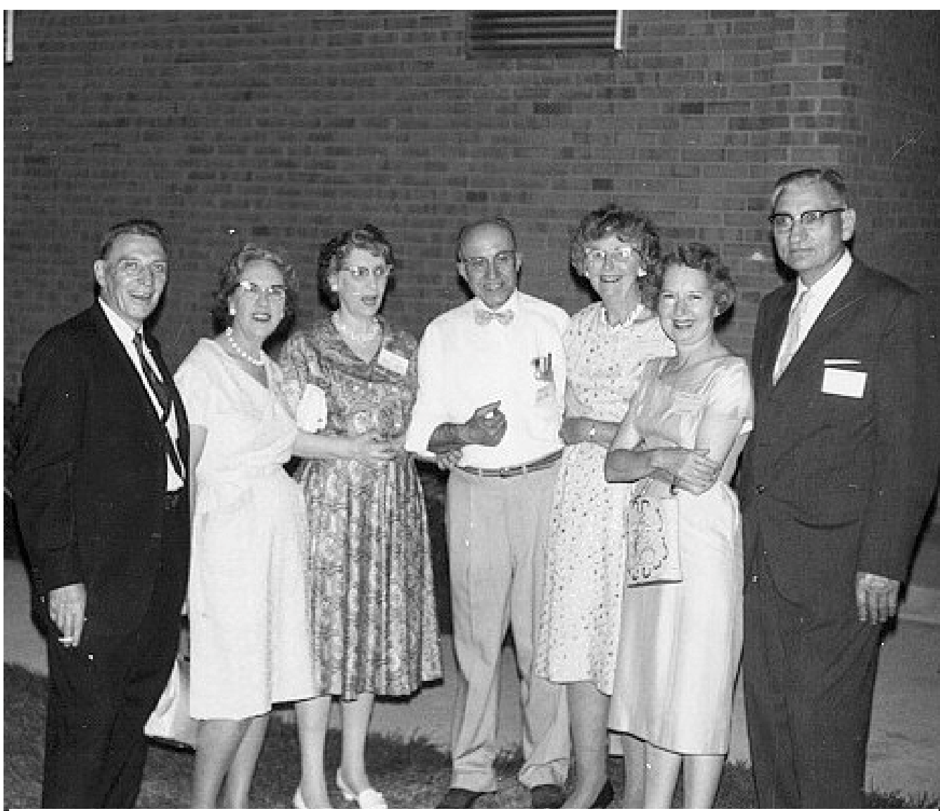
Attendees and wives enjoying the pleasant evening air of Maryland.