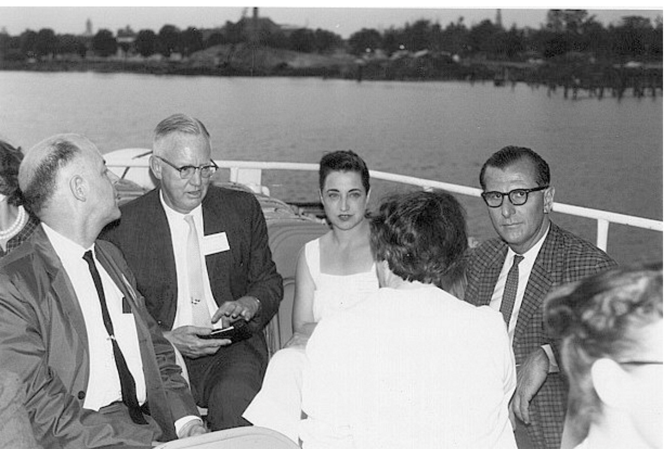
Attendees enjoying a boat trip on the Potomac River.